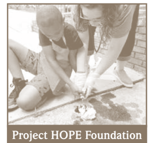
Project HOPE Foundation

Bridging Philanthropy & Purpose — We've been strengthening the network of organizations doing great things for Greenville for over 60 years. Your donation helps us continue our commitment to improve quality of life for everyone. Let's work together.