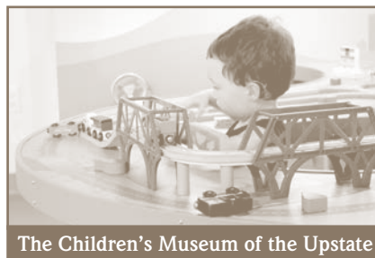
The Children's Museum of the Upstate