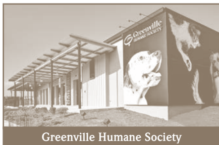
Greenville Humane Society